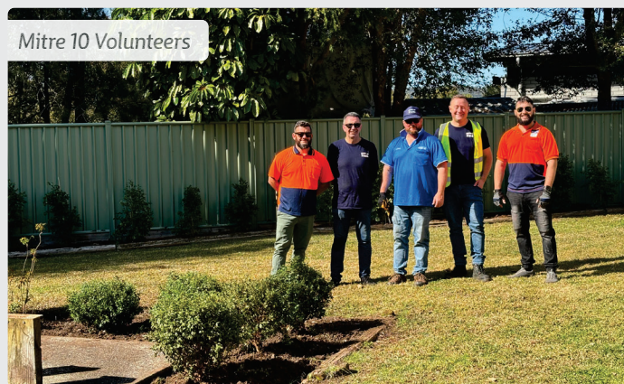
Mitre 10 Volunteers