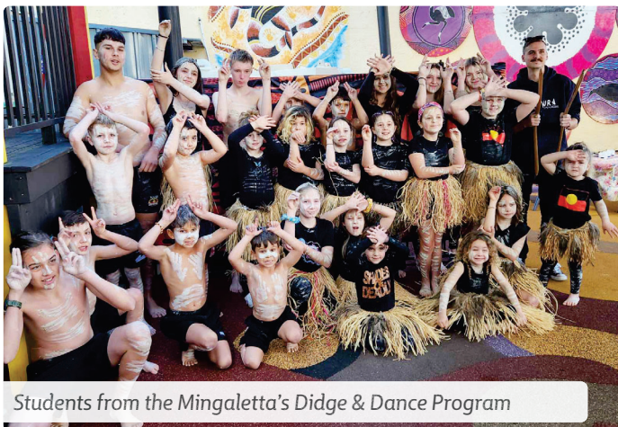
Students from the Mingaletta's Didge & Dance Program

In July, our team members were thrilled to participate in community NAIDOC events across the Central Coast at Wyong, Ourimbah and Umina Beach. It was inspiring to see so many community members come together, embracing the spirit of unity and cultural celebration. These gatherings are crucial for fostering a sense of belonging and shared respect within our community.