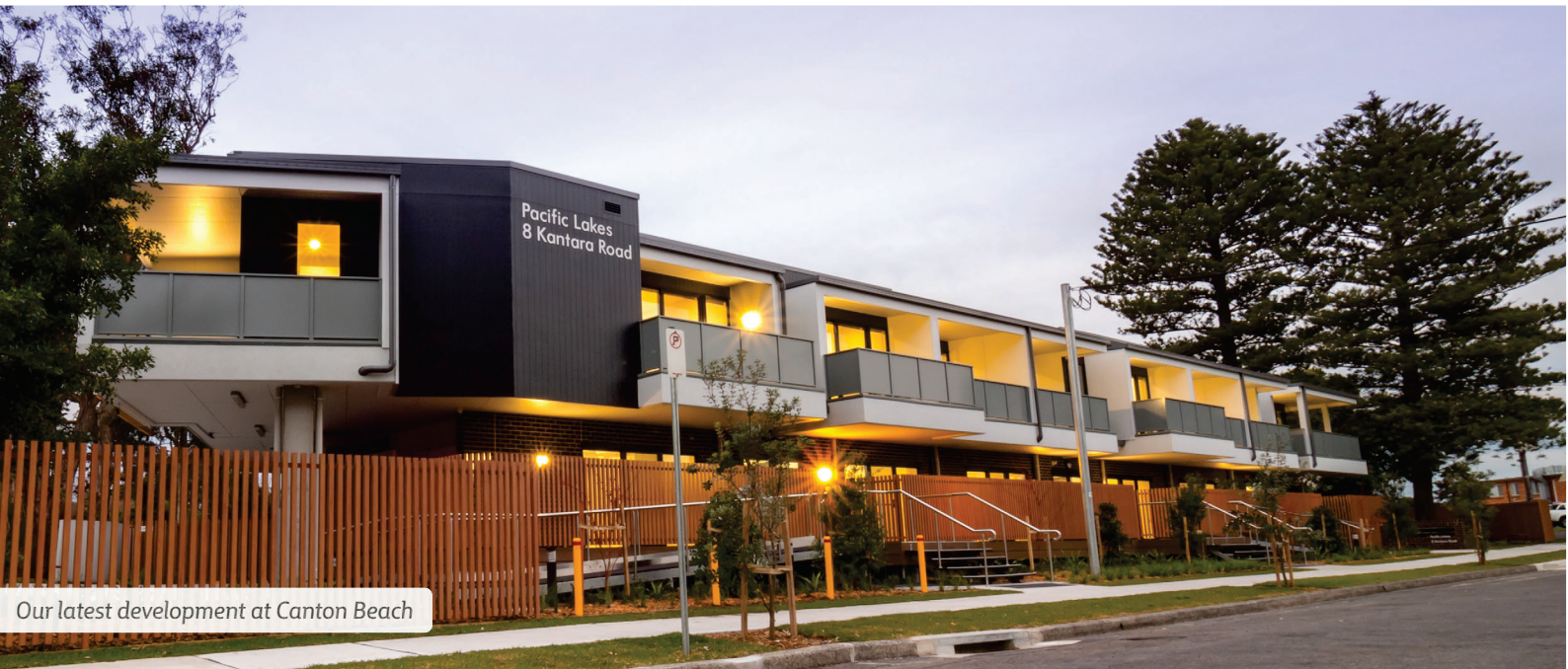
Our latest development at Canton Beach